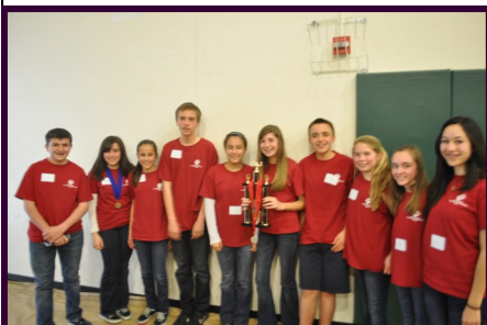
Academic Decathlon Team

We congratulate the School, the team and its coaches for such great achievements!