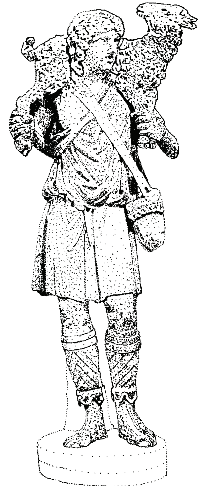
3 rd century statue of the Good Shepherd

Parish communities have discovered that images can be placed in a variety of spaces throughout a church,